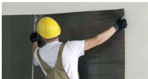
Adhesive lead sheets